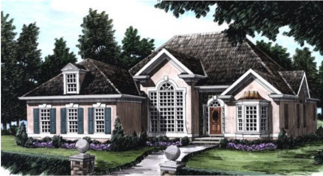
Artist Rendition—Copyright Frank Betz & Associates - Chadwick Plan Pictured—Subject to Change at Builder Discretion..

With solid hardwood floors, custom tile floors, extensive tile bathrooms, and 9 foot ceilings - plus soaring, vaulted ceilings in the family, great, or living rooms – Stanton Homes always feel spacious and welcoming. As always, the master suites are especially pleasing. All have vaulted master bathrooms, with custom tile floor, soaking tub with custom tile surround, separate custom tile shower with glass enclosure , and dual vanities. All master bedrooms include a detailed tray ceiling and extensive, two-piece crown moulding. Some even have private sitting rooms!